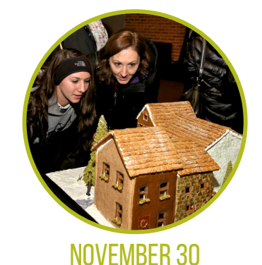
SCENTS & SWEETS COMPETITION - PRESENTING SPONSOR $1,500

The Scents & Sweets Competition provides an opportunity for professionals and amateurs to create festive gingerbread houses and holiday wreathes that compete for Judges' and Peoples' Choice awards!